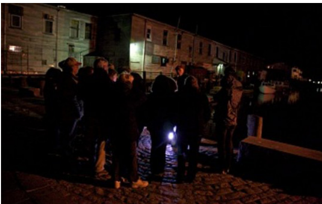
Wicked Walking Tours 1:00 - 2:15 pm

Striped bass fishing with Go Fish Charters .