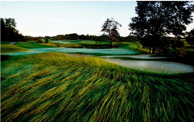
Golf 12:30 - 6:00 pm

Scramble format at Purpoodock Country Club in Cape Elizabeth, ME.