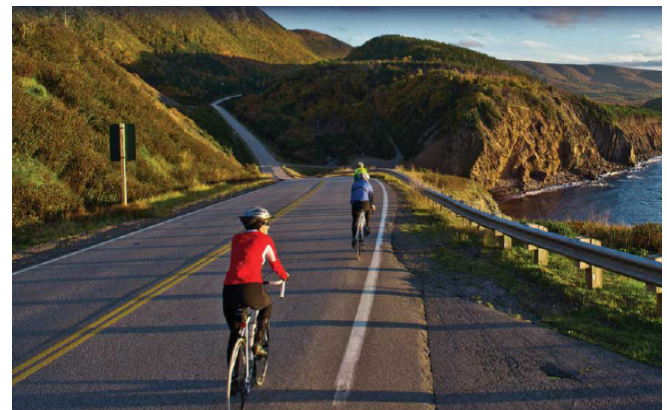
Bike and Brews Tour 1:15 - 3:15 pm

Guided Wicked Walking Tour of Portland's Old Port.