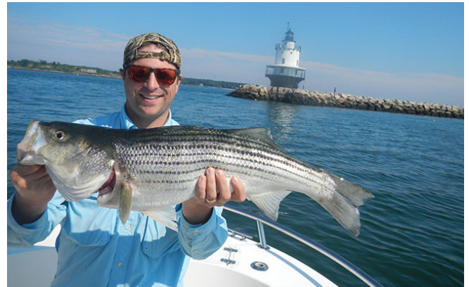
Charter Fishing 1:00 - 4:00 pm

Scramble format at Purpoodock Country Club in Cape Elizabeth, ME.